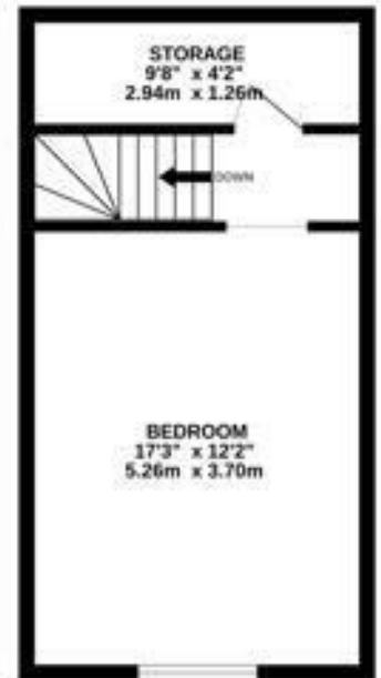
TOTAL FLOOR AREA: 1014 sq ft (94.2 sq.m.) approx.

Whilst every attempt has been made to ensure the accuracy of the floorplan contained herein, measurements of doors, windows, rooms and any other items are approximate and no responsibility is taken for any error, omission or mis-statement. This plan is for illustrative purposes only and should be used as such by any prospective purchaser. The services, systems and appliances shown have not been tested and no guarantee as to their operability or efficiency can be given. Made with Metropix 7.0(202)